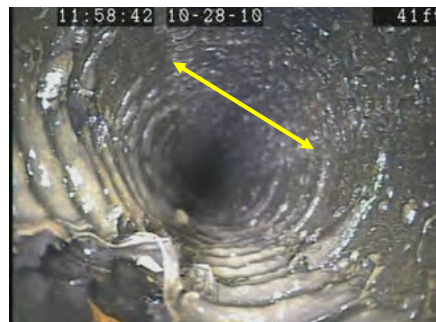
Branch line with significant corrosion deposits, clear air-water interface