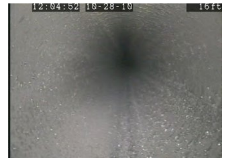
Same branch line with no corrosion, water filled with no air-water interface

Investigating four locations within a fire sprinkler system, as required by NFPA 25, is not an appropriate method of evaluating corrosion activity and does not insure that locations most likely to experience corrosion will be investigated. It is imperative to identify locations that have been damaged by corrosion or are obstructed by corrosion by-products.