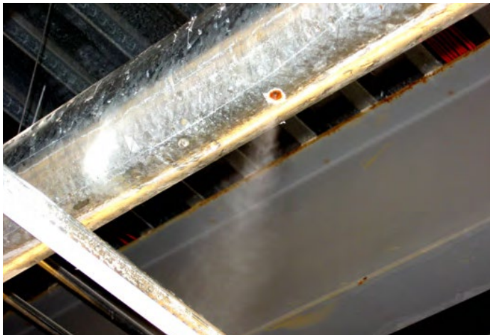
Galvanized Pipe Leak

An ECS Fire Sprinkler System Corrosion Assessment combined with surgical pipe replacement and a corrosion control program can save up to 90% of total system replacement costs and significantly extend the useful life of the existing sprinkler system.